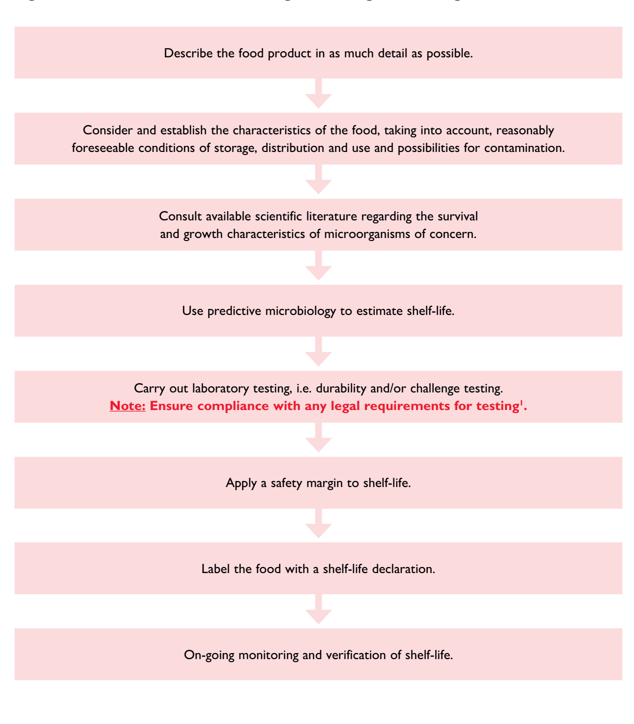
Figure I. Good Practice in Estimating, Validating and Setting Shelf-life